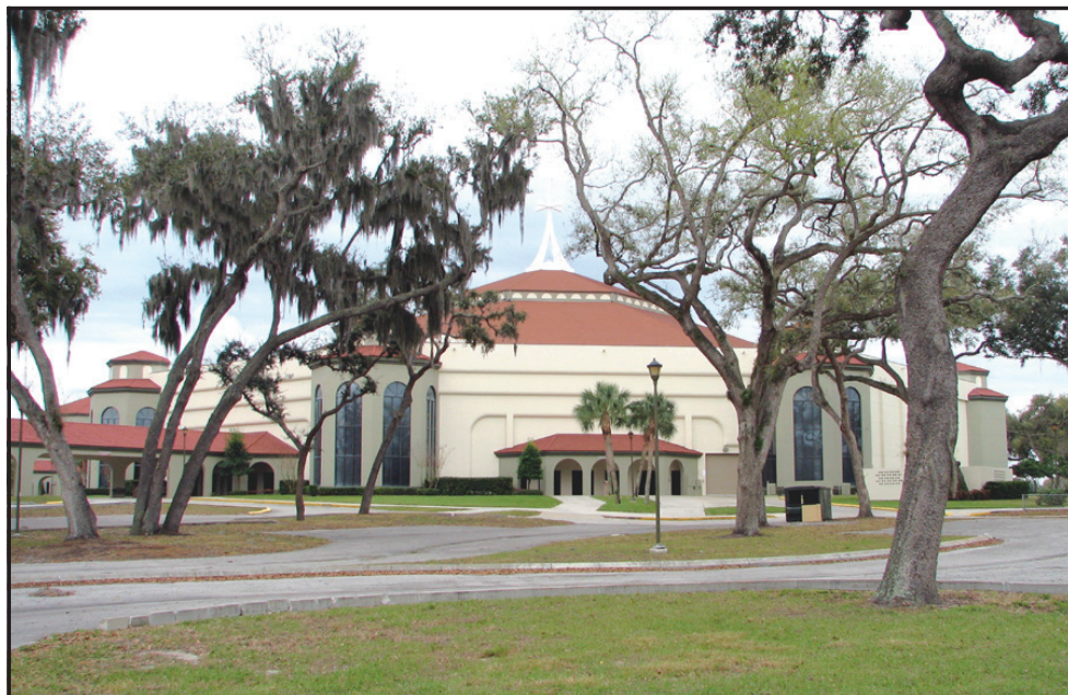
In June 2005, the Whites' Without Walls International Church agreed to purchase Carpenter's Home Church in nearby Lakeland. The 10,000-seat auditorium, located on a 75-acre campus, was sold for about $8 million. It was renamed Without Walls Central and dedicated on Sept. 11, 2005.

In July 2005, the Tampa Tribune reported that WWIC was the nation's fastest-growing church, having added 4,330 attendees during the previous year. 10 That figure significantly eclipsed Joel Osteen's Lakewood